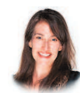
MARNI USHEROFF STAFF WRITER

O.C. unemployment is lowest since May 2008. State figure down to 7.8 %.